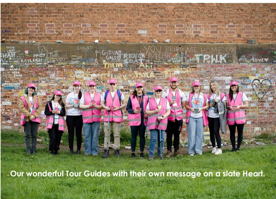
Our wonderful Tour Guides with their own message on a slate Heart.

Lastly, any profits raised by the Tours will go back into our Holmes Chapel Community. We'll hopefully be able to provide an update on where any money raised will go later in the year when the Tours finish in September.